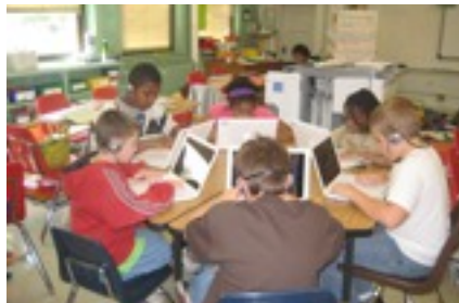
Students use laptops to strengthen their skills