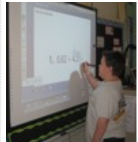
Smartboards are used daily.

We incorporate technology into our classrooms on a daily basis. Ask your child what technology what technology they used today.