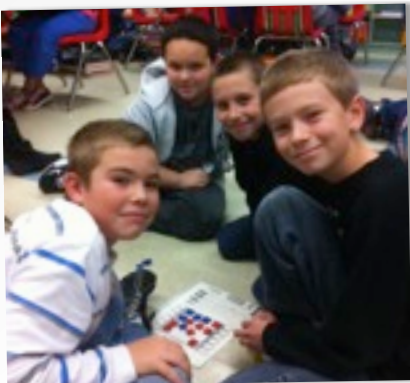
5TH GRADE MATH GROUPS

Although it seems hard to believe, there is only 16 school days left until our Winter holiday break! With that being said, we also have only 16 days until the end of the second quarter. Our fifth grade students have been working very hard during the second quarter and they have hoping learned a lot of new skills. By the end of second quarter, our students should all know how to read to comprehend a variety of text, find the author purpose and viewpoint, add, subtract, multiply and divide, listen effectively in a classroom setting, and we have increased our knowledge of adding technology into our daily work. It has been a great first half of the school year and we are looking forward to a great second semester!