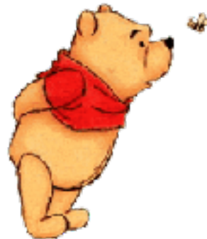
Winnie the Pooh

On Wednesday, when the sky is blue, And I have nothing else to do, I sometimes wonder if it's true That who is what and what is who