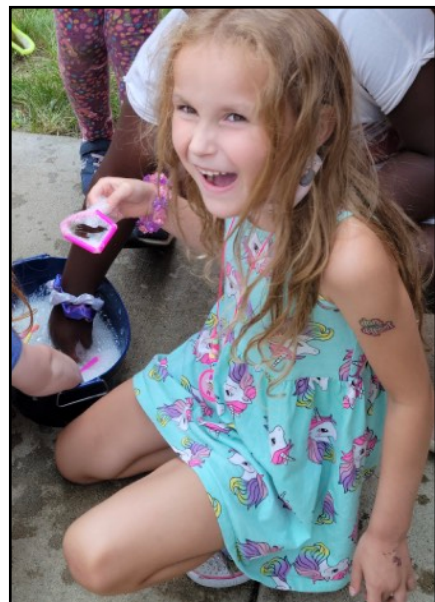
SUMMER SCENES — SCOPERs display a Pokemon ball made out of an old computer disc (left) and a home-made bubble wand. The bubbles were part of an outdoor STEM unit presented by the Girl Scouts of Central Illinois.

Reminder for parents: If you haven’t already, please register your children for the 2021-22 school year through the District 186 Web site, and then go to www.sps186.org/scope to register for Project SCOPE.