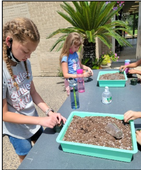
Above, SCOPERs plant seeds during a field trip to Washington Park Botanical Gardens. In the photos at right, SCOPERs display some of the crafts they have made this summer.